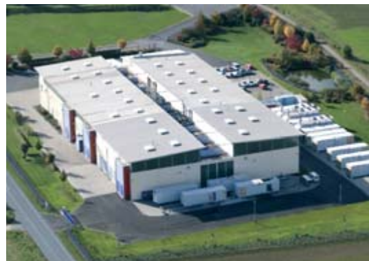
Assembly & Testing Facility, Bilshausen