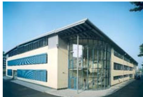
Manufacturing Facility, Osterode, Hall 5

'these facilities are widely regarded as the most comprehensive of their kind'