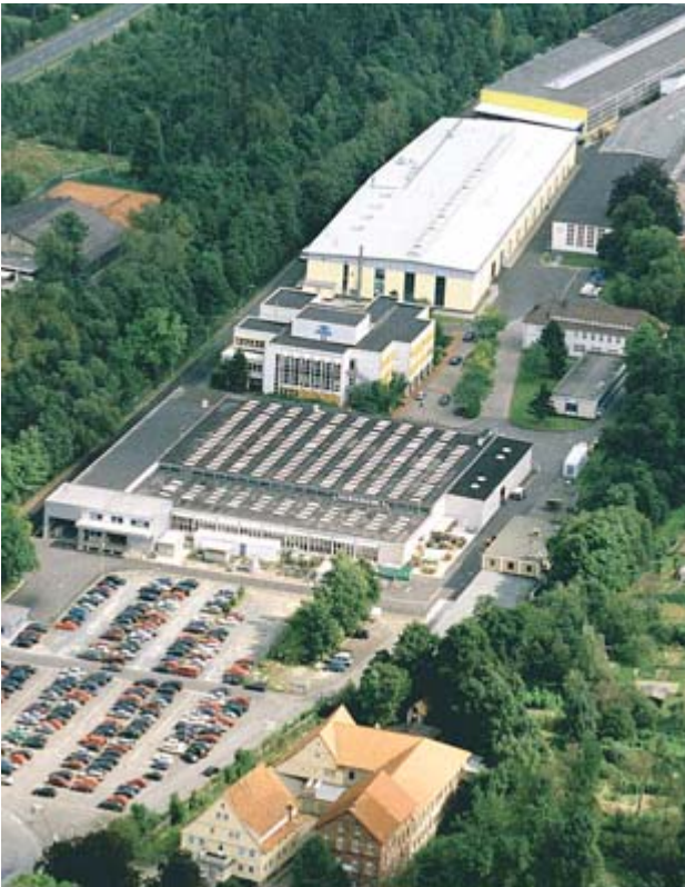
Piller Headquarters & Manufacturing Facility, Osterode