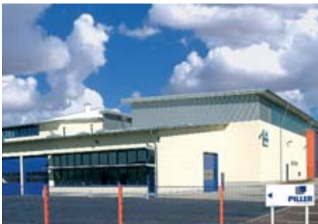
Assembly & Testing Facility, Bilshausen

Modern, purpose-built manufacturing facilities at Piller Osterode headquarters site in Germany, and purpose-built assembly and testing facility at nearby Bilshausen, extend to some fourteen hectares and approaching 50,000m 2 of accommodation. These facilities are absolutely state-of-the-art, and are widely regarded as the most comprehensive of their kind.