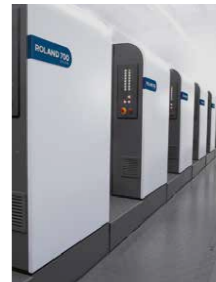
The ROLAND 700 EVOLUTION , launched in 2016 and now widely regarded as 'best in class'. The company will unveil its latest offering to the market at DRUPA 2020, in June.

During our stewardship of the company, investment in product development has continued unabated and 2019 was no exception. In 2016, the company unveiled its ROLAND 700 Evolution press, developed entirely during our stewardship and formally launched at DRUPA 2016, is now widely regarded as 'best in class'. The company will unveil its latest offering to the market at DRUPA 2020 in June this year.