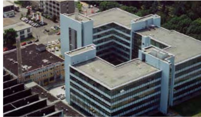
Senefelderhaus, the former Manroland AG headquarters building is to become a police training academy.

During the year, the second phase of alterations at Senefelderhaus, the former Manroland AG headquarters, located in nearby Mühlheim, were completed and occupied by the Bundespolizei as a training academy. A letter of intent was received for the remaining three floors with a fresh lease anticipated, once the entire building is occupied.