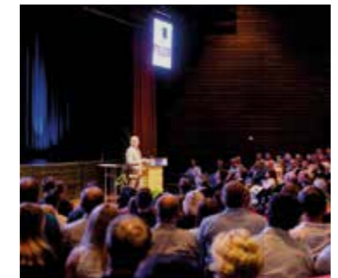
Piller celebrates 100 years in Osterode.

In August, Piller celebrated '100 Years in Osterode' and I was invited by the Mayor of Osterode to have the honour of signing the 'Golden Book' of the city. Employees past and present and their families attended the Spa Park Convention Centre to mark the occasion and over 4,000 people, which seemed like the entire population of Osterode, turned out to join the celebrations afterwards.