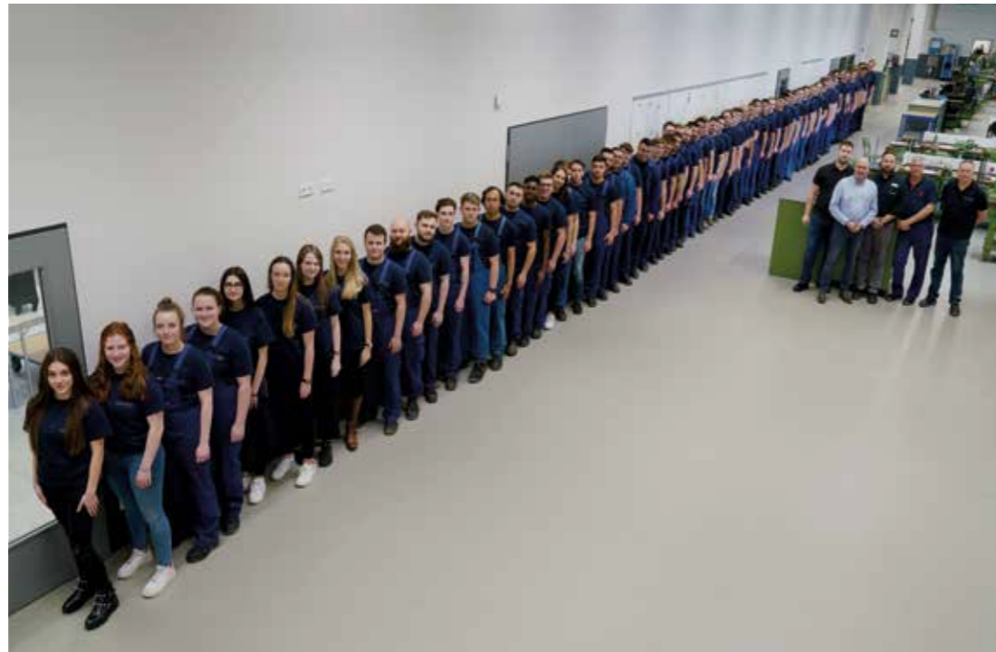
Manroland apprentices – training unabated under Langley stewardship.

Finally during the year, a contract to sell approximately 15 hectares (37 acres) of surplus land for development became effective. Preconditions to the sale contract were all finally met in 2019 and circa €19 million of cash is expected in March 2020.