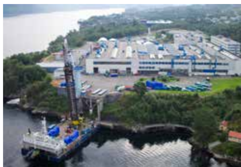
The Bergen Engines AS facility near Bergen, in Norway.

“...highly innovative in adapting its engines to low carbon and non-fossil fuels.”