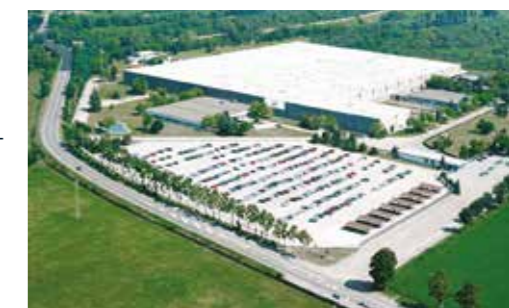
The Marelli Motori factory in Arzignano, northern Italy. Production moved back from Malaysia.

Acquired in May 2019, Marelli now operates entirely from its 16 hectares (40 acres) freehold site in northern Italy. The company has sales, distribution and service subsidiaries in the United States, Germany, South Africa and Malaysia.